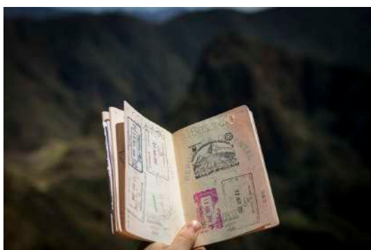
AFC-ISH V 3.0

The principal course is the main course of study to be undertaken by you, where the student visa has been issued for multiple courses and is usually the final course of study.